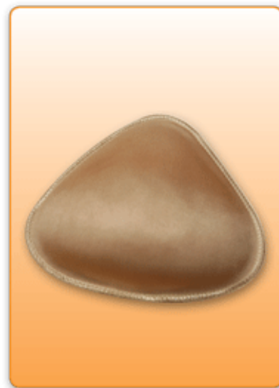
Figure 5.2: A soft-form or lightweight prosthesis.

machine-washable and lightweight. In different countries they may be called “comfies”, “softies,” “falsies” or a “filler.” You may find that the soft-form prosthesis can “ride up” because it’s so light. It may look better if you adjust the stuffing and pin it to the bottom of your bra cup. If you want to wear a bra with your soft prosthesis, try one that is soft and stretchy, without an underwire. Remember, your first bra after a mastectomy has to be easy to take on and off because your shoulder may be stiff at first if you have had surgery on your lymph nodes.