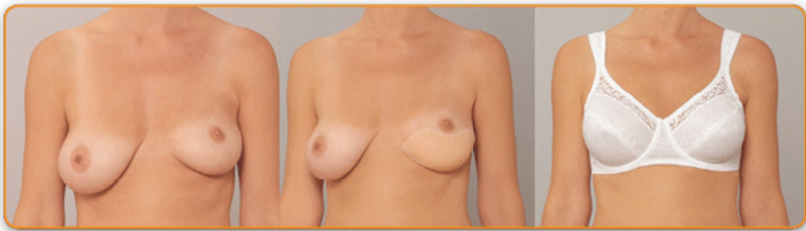
Figure 5.4: A smaller partial prosthesis, sometimes useful after breast conservation.

Smaller prostheses for women who have had breast conservation surgery are available. These may be worn inside the bra and are shaped to fill out a small part of the breast ( Figure 5.4 ). They are made of the same silicone material as most full-breast prostheses. Some have a stick-on backing.