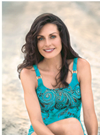
Figure 5.7: Specialized swimwear with adjustable shoulder straps and a special bust with pockets on both sides to allow a breast prosthesis

These bras, available from most major manufacturers who specialize in post-breast surgery products, have pockets in both cups to fit a soft-form prosthesis. The soft cotton helps with any discomfort associated with your scar. They are also very good during radiotherapy not only because you can get them off quickly for your daily treatment but also because these bras are relatively inexpensive so it's no problem if you get any of the skin marks from your radiotherapy on the bra.