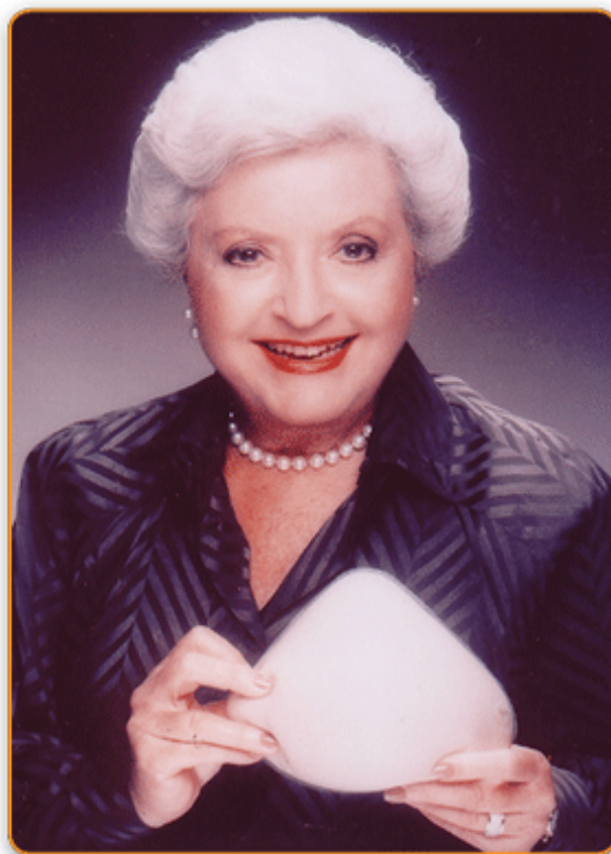
Figure 5.1: Ruth Handler, inventor of BARBIE® Doll and founder and creator of the original NEARLY ME® line of Breast Prostheses.

Ruth Handler (1916–2002) was an American businesswoman and president of the toy manufacturer Mattel, Inc., who is remembered primarily for her role in creating and marketing the BARBIE® doll ( Figure 5.1 ). In the '70s, after having a mastectomy, she was not impressed with the quality of prostheses and started a company that produced the original NEARLY ME® line of breast prostheses. You'll probably want to buy two types of breast prostheses: a non-weighted and a weighted one.